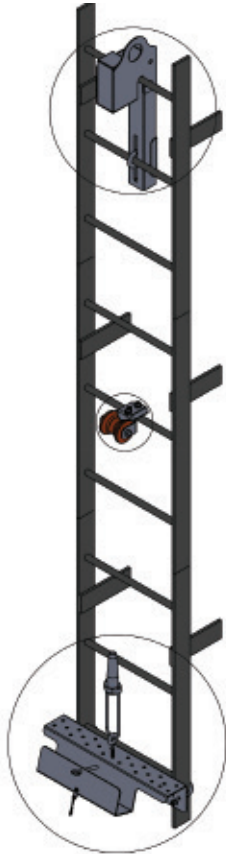
LOWER FIXED LADDER